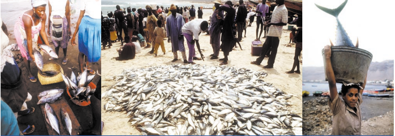
ABOVE: West African waters are plagued by illegal fishing vessels that deplete local fish stocks, ruining livelihoods and jeopardising food security in the region.