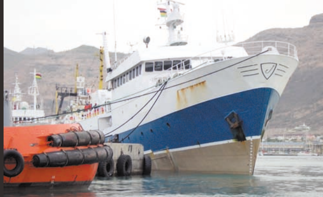
ABOVE: The Inca (now Condor) in Port Louis, Mauritius, in September 2004.

In 2001/2, renamed Viking and flagged to the Seychelles, the vessel unloaded toothfish in Port Louis, Mauritius. The Seychelles