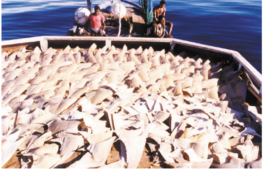
ABOVE: Illegal shark fin catch. Efforts to sustainably manage fisheries are severely undermined by IUU fishing.