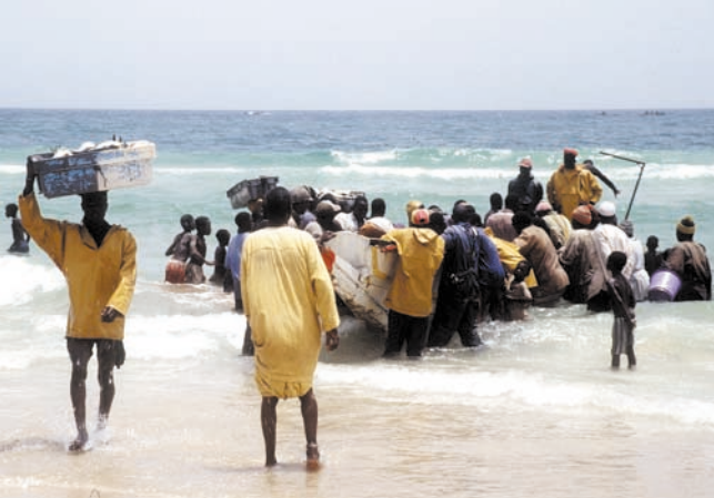
ABOVE: IUU operators use unfair competition and make the most of other people's poverty.