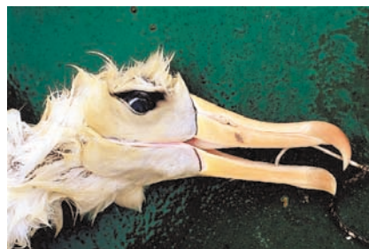
ABOVE: Tens of thousands of endangered albatrosses are killed each year by illegal long-line vessels in the Southern Ocean.

However, several near-term, cost-effective and “real-world” solutions are available to the international community. For example, closing the loophole in international law that allows States to issue Flags of Convenience would be the single most effective step in eradicating IUU fishing 10,19 – what is needed now is determined international political leadership to turn these opportunities into action.