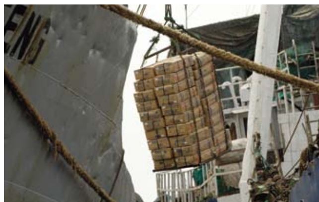
Bottom: Frigoluz – one of the largest fish processing companies in Europe – receiving CNFC fish.