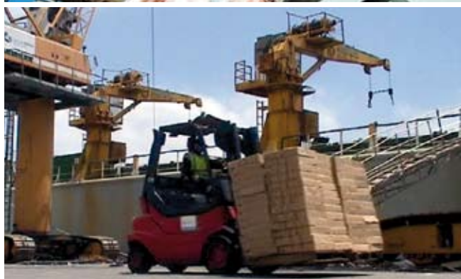
Top: Fish being unloaded in Las Palmas Bottom: The Elpis, implicated in IUU fishing operations off Guinea, being unloaded in Las Palmas.