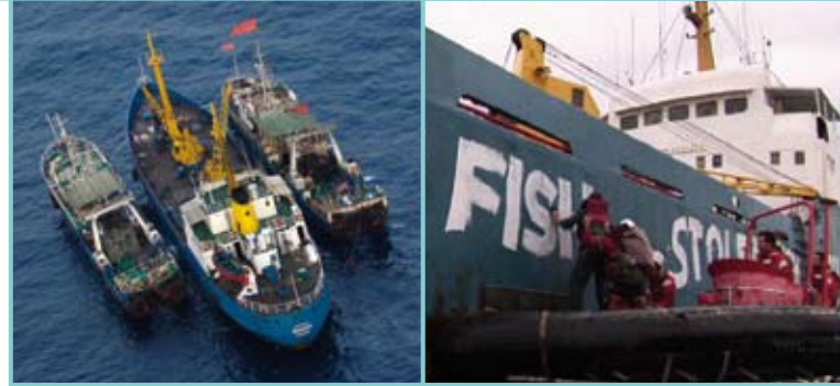
Left: The Binar 4, illegally transshipping fish off the coast of Guinea Right: Fleeing from Guinean waters towards Las Palmas with its illicit cargo, the Binar 4 is branded a pirate. EJF/Greenpeace findings were forwarded onto the Las Palmas fishing authorities.

The Port Authority records show that the Elpis has been a regular visitor to Las Palmas, making 18 stops since January 2003 64 .