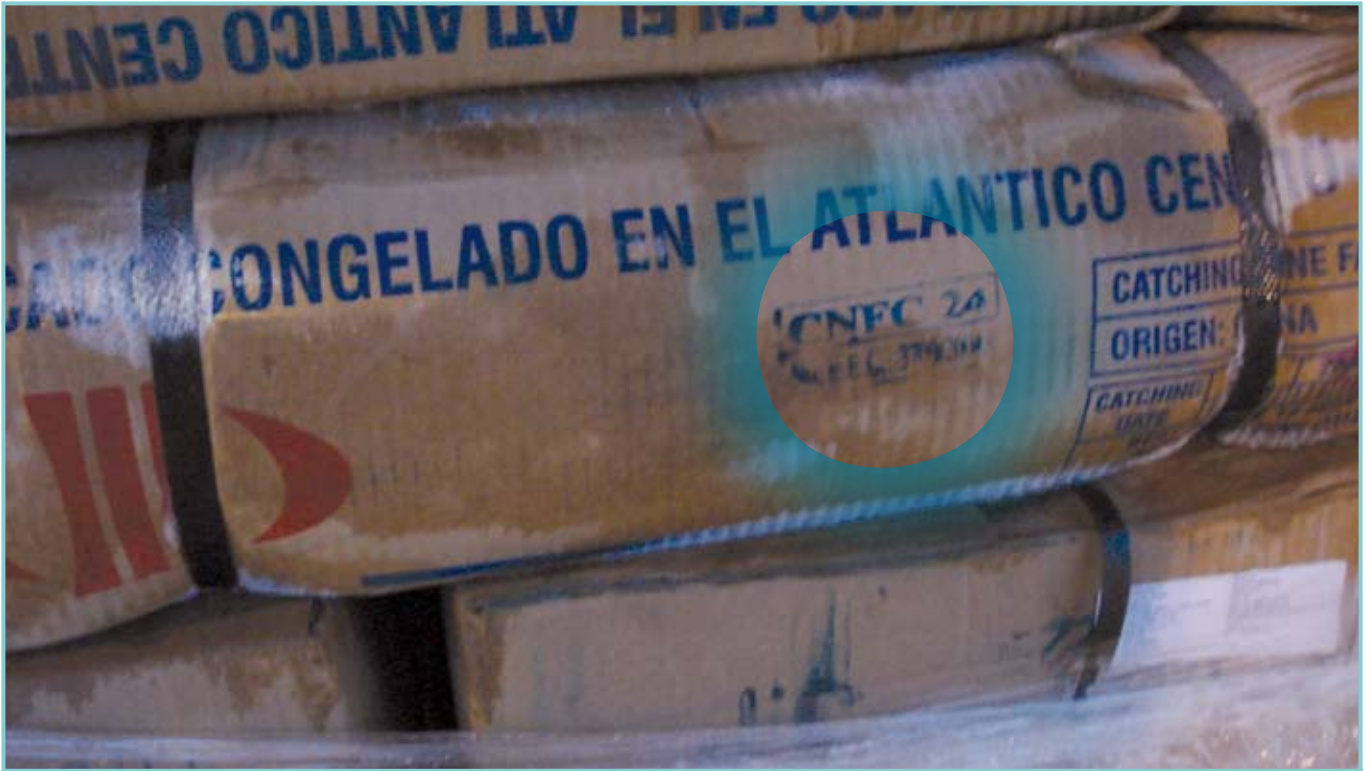
Above: Boxes of possible IUU fish for sale in Billingsgate Market. Despite being labelled as "Origen: China", examination of the FAO Catch Area shows they were caught off West Africa. Unusually, the name of the catch vessel is clearly legible: CNFC 24 – observed in Guinea in 2006 illegally transshipping fish at sea.