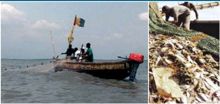
Top left: Marine fishing provides 70,000 direct and indirect jobs in Guinea. Yet Guinea is estimated to be losing $110 million every year to IUU fishing, posing a serious threat to a population dependent on fish stocks for food and livelihoods.