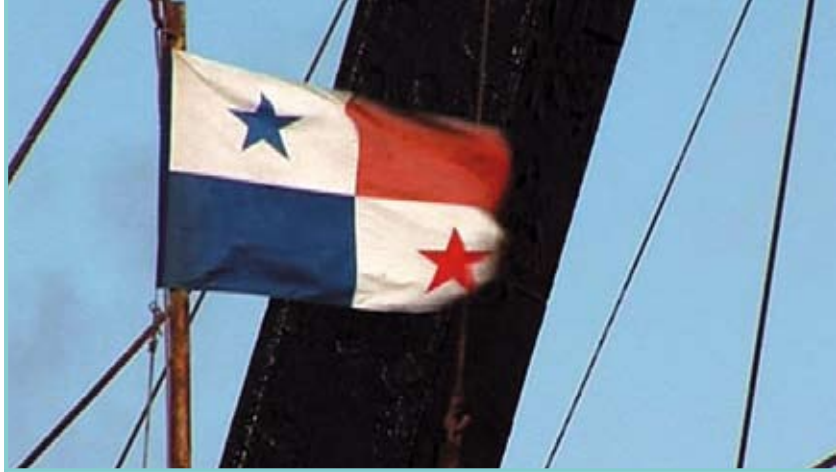
Flags of Convenience, like that of Panama, provide perfect cover for IUU fishing activities.